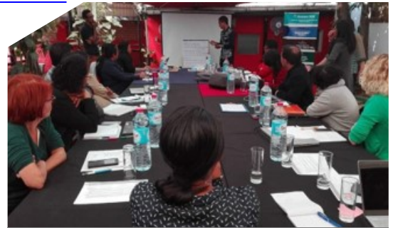
FP Committee meeting, Madagascar February 2020

WHO supported the Ministry of Health to develop an implementation guide to improve quality of care of FP services. The guide is under review and will be used to train regional and district managers.