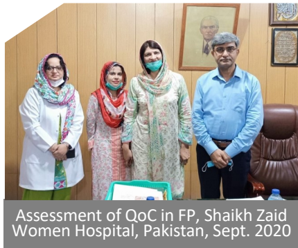
Assessment of QoC in FP, Shaikh Zaid Women Hospital, Pakistan, Sept. 2020