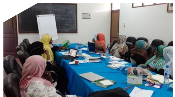
Review of midwifery pre-service curriculum Zanzibar, Tanzania, August 2020