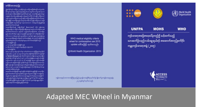
Adapted MEC Wheel in Myanmar

MEC wheels (English version) were distributed to the Department of Public Health (Maternal and Reproductive Health Division) and OBGYNs from both public and private sectors in Yangon region.