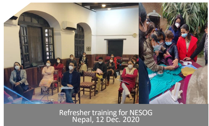
Refresher training for NESOG Nepal, 12 Dec. 2020

FIGO and WHO organized a refresher training on PPIUD insertion for members of the Nepal Society of Obstetricians and Gynecologists (NESOG).