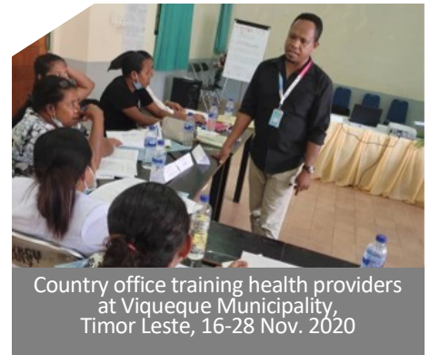
Country office training health providers at Viqueque Municipality, Timor Leste, 16-28 Nov. 2020

Using the harmonized national family planning training tool, a national training workshop was held for midwives and medical doctors from identified community health centers and health posts in Viqueque municipality in November 2020. A follow-up training, planned in March 2021, was postponed due to the second wave of COVID-19.