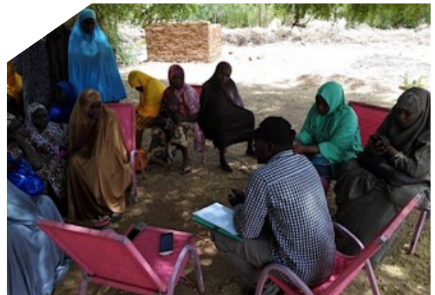
Focus group discussion to understand women's perspective on PPFP, Dosso, Niger, April 2021

The Ministry of Health requested WHO to assess the quality of FP services in Mali in 12 health facilities (2 health districts per region and 2 CSCom per district) in 3 regions (Sikasso, Koulikoro and Segou), using the WHO quality assessment tool. The results will help develop an improvement plan for quality of FP services.